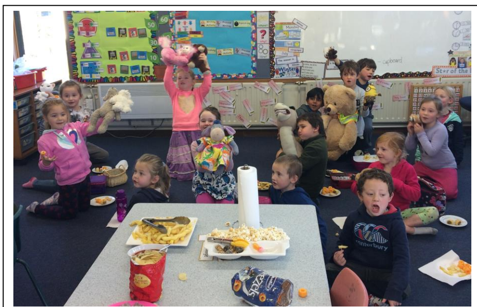
Room 1 children with their teddy bear's enjoying their picnic on Monday.