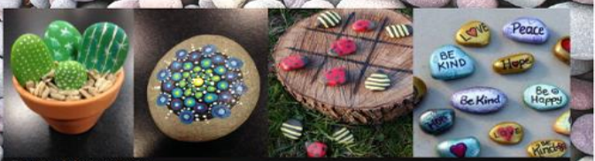
Examples of what we can make...